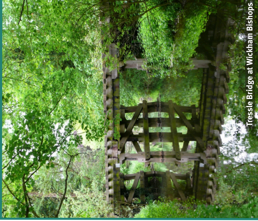
Tressle Bridge at Wickham Bishops

Country Parks - Discover our parks and open spaces